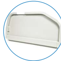
REMOVABLE SIDE PANELS