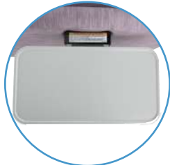
FOLD DOWN, SIDE TABLES