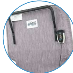
REAR PUSH HANDLE