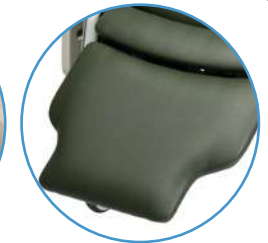
INTEGRATED LEG AND FOOTREST