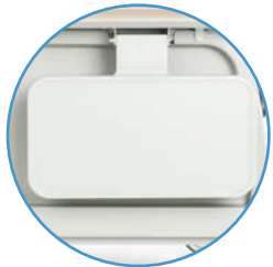
FOLD DOWN, FLUSH-MOUNT SIDE TABLES