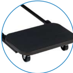
PULLOUT FOOTPLATE 3