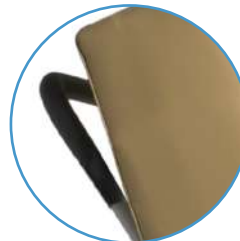
REAR PUSH HANDLE