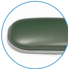
SOFT, WIDE ARMREST