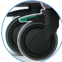
TENTE ® CASTERS