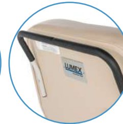
REAR PUSH HANDLE