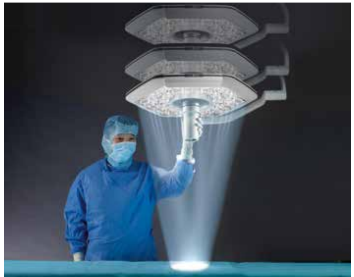
Even lighting at every distance

If the usual working distance is changed, the 3D sensor in the iLED™ 7 Surgical Light automatically adjusts the light field size and illumination level of up to 160,000 lx. OR Staff is able to work under consistent lighting conditions at all times, without the need for manual adjustment saving time and allowing the surgeon to concentrate on the surgical site.