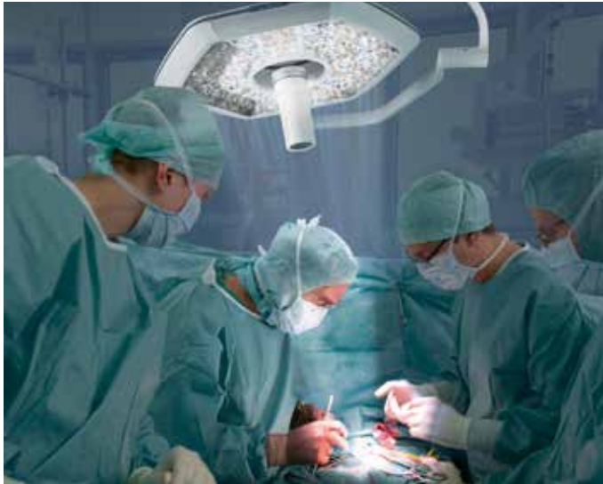
3D sensor technology provides unchanged lighting of the surgical field