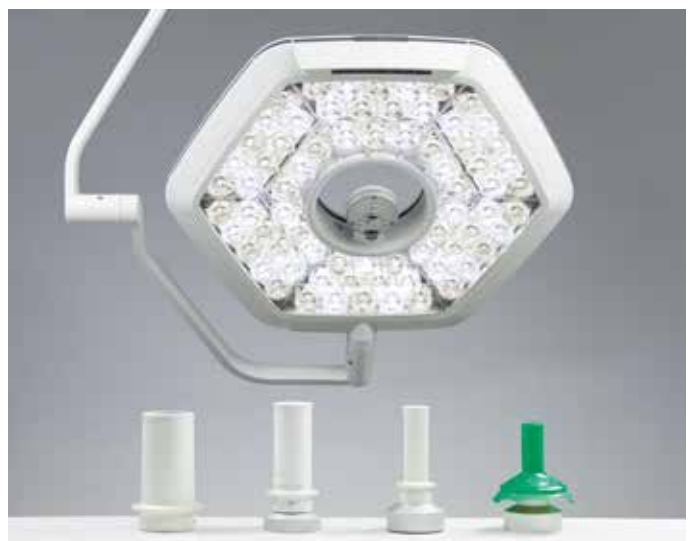
Various handles can be fitted to the handle unit for functional flexibility

The uniform handle unit enables the iLED™ 7 Surgical Light to be equipped with a standard handle, sterile operating handle or disposable handle making it adaptable to the current staff requirements. If you purchase the TruVidia™ Wireless Camera now or in the future, it can be connected without the need for modifications. You can also combine the OR light with other Trumpf Medical™ devices, such as the innovative TruConnect™ OR Integration System.