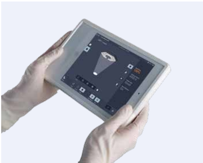
Intuitive and reliable operation from the get-go

The iLED™ 7 Surgical Light's sensor-controlled assistance system provides even lighting conditions and eliminates shadows, even when the surgeon is working directly beneath the OR light. The system identifies obstacles in the field of illumination and activates or deactivates individual LED modules accordingly. As a result, the surgical field is properly illuminated without the need for manual adjustment allowing the surgeon to focus on the patient and the task at hand.