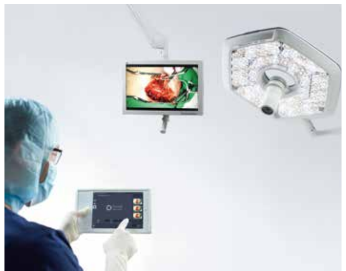
The TruVidia™ Wireless Camera provides excellent image quality and encrypted transfer provides maximum data security

The iLED™ 7 Surgical Light can be directly connected to the innovative and delay-free TruVidia™ Wireless Camera System via the handle unit interface, providing brilliant recordings in full HD. Individual images for documentation purposes are possible using the snapshot function. Benefits of wireless technology: ability to install and/or upgrade this system at no additional cost or the need for complex video cabling. In addition, it can be controlled from the mobile tablet or wall-mounted operating panel.