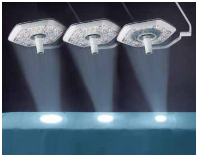
For standard working distances, you can select from three preconfigured light field sizes

Consistent lighting field sizes are available for the commonly required distances in surgery of 0.8 to 1.3 meters. With the unique SmartPattern function, three different sizes are available. After setting the illumination field size, the iLED™ 7 Surgical Light automatically stores the setting even after manual adjustment of the working distance.